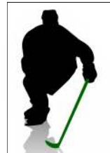
Figure Skating or Hockey?

New this year, we will be offering separately a hockey and figure skating track. You can expect some specific training on and off ice each day for both hockey and figure skating. Simply select figure skating or hockey on the registration section of the flyer.